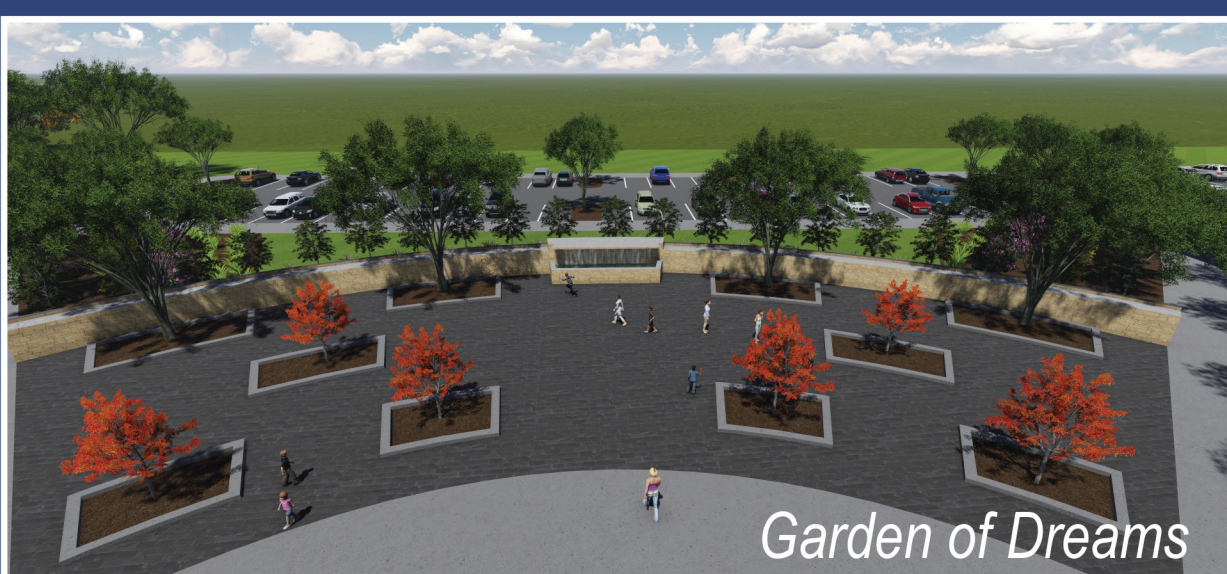
Garden of Dreams