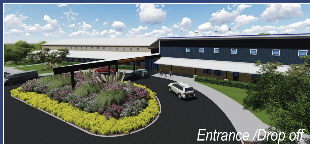
Entrance /Drop off