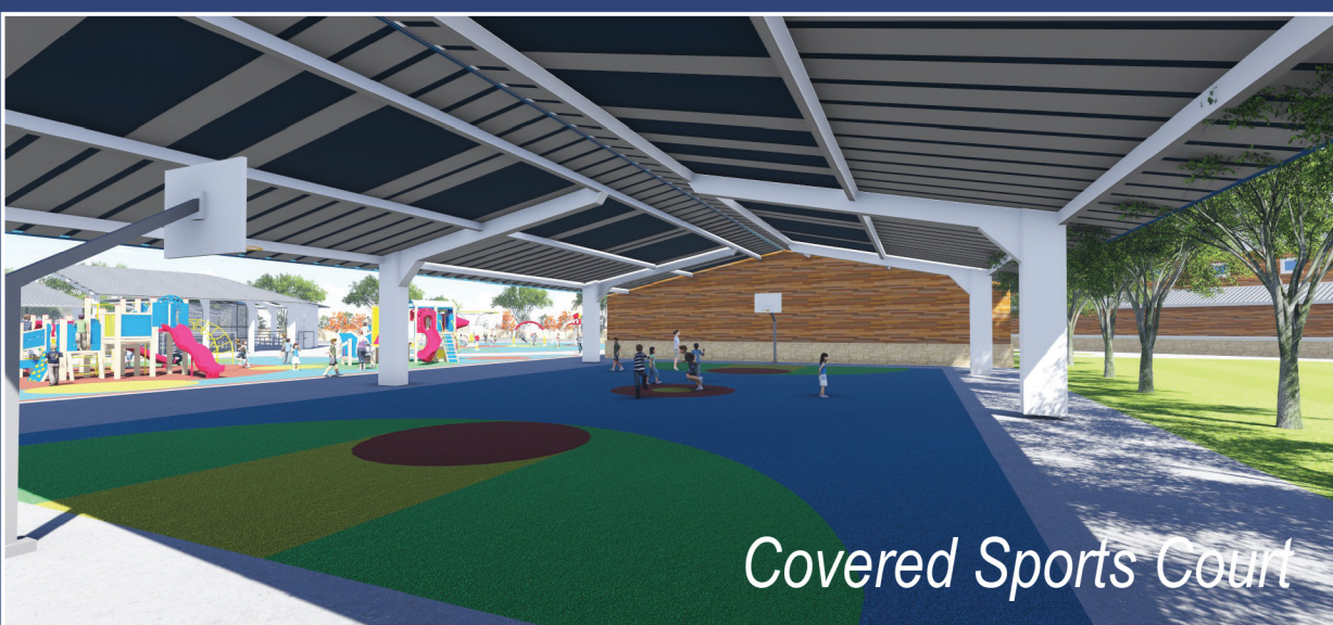
Covered Sports Court